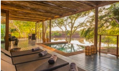
BAYETE ZULU PRIVATE

Bayete Zulu Lodges are set in the heart of the 'Big-5' Manyoni Private Game Reserve, in northern KwaZulu-Natal and cater for both couples seeking a romantic escape and family & friend getaways. Self-catering & Catered options across our three Lodges are available, affording you the luxury of choosing how you package your stay.