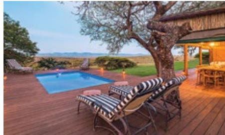
LITTLE BAYETE ZULU