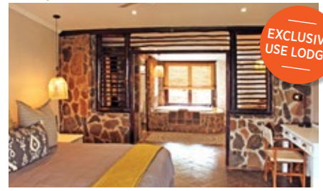
BAYETE ZULU HOMESTEAD