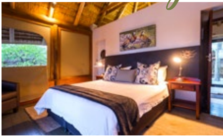
BAYETE ZULU PRIVATE