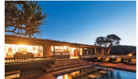
BAYETE ZULU HOMESTEAD