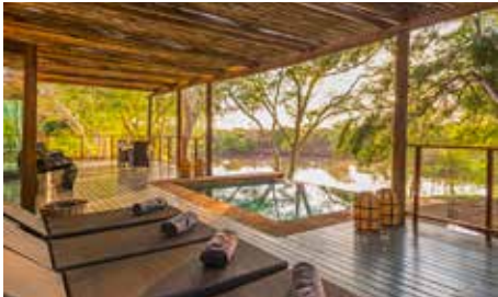
BAYETE ZULU PRIVATE

Bayete Zulu Lodges are set in the heart of the 'Big-5' Manyoni Private Game Reserve, in northern KwaZulu-Natal and cater for both couples seeking a romantic escape and family & friend getaways. Self-catering & Catered options across our three Lodges are available, affording you the luxury of choosing how you package your stay.