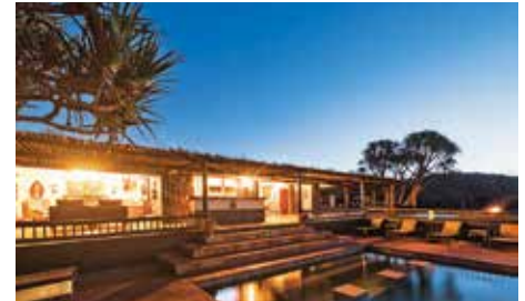
BAYETE ZULU HOMESTEAD