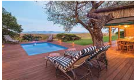
LITTLE BAYETE ZULU